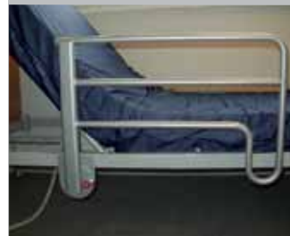
Half length mobility assist siderail