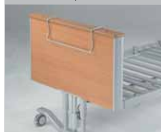
Pump Bracket accessory