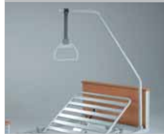
Lifting Pole accessory